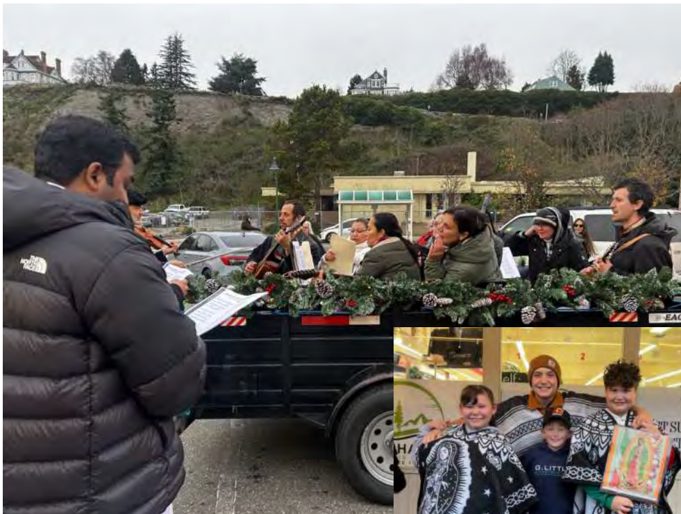
Feast of Our Lady of Guadalupe at St. Mary Star of the Sea, Port Townsend.