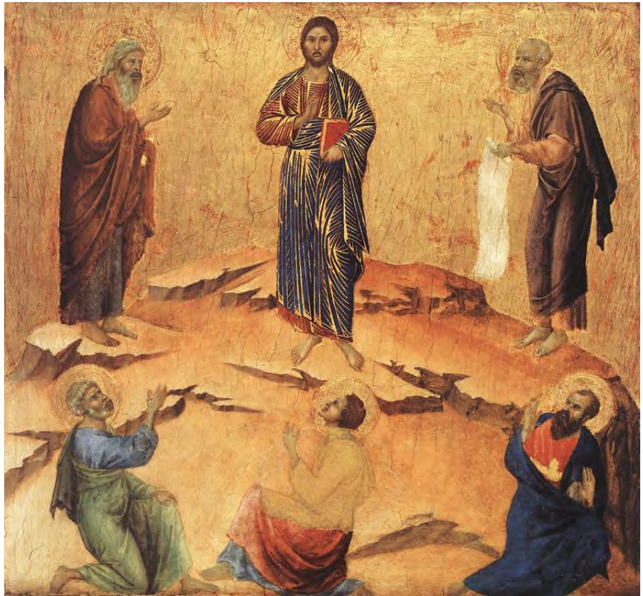
This file is made available under the Creative Commons CCo 1.0 Universal Public Domain Dedication.

“This is my beloved son, with whom I am well pleased; listen to him.” ~ Matthew 17:5