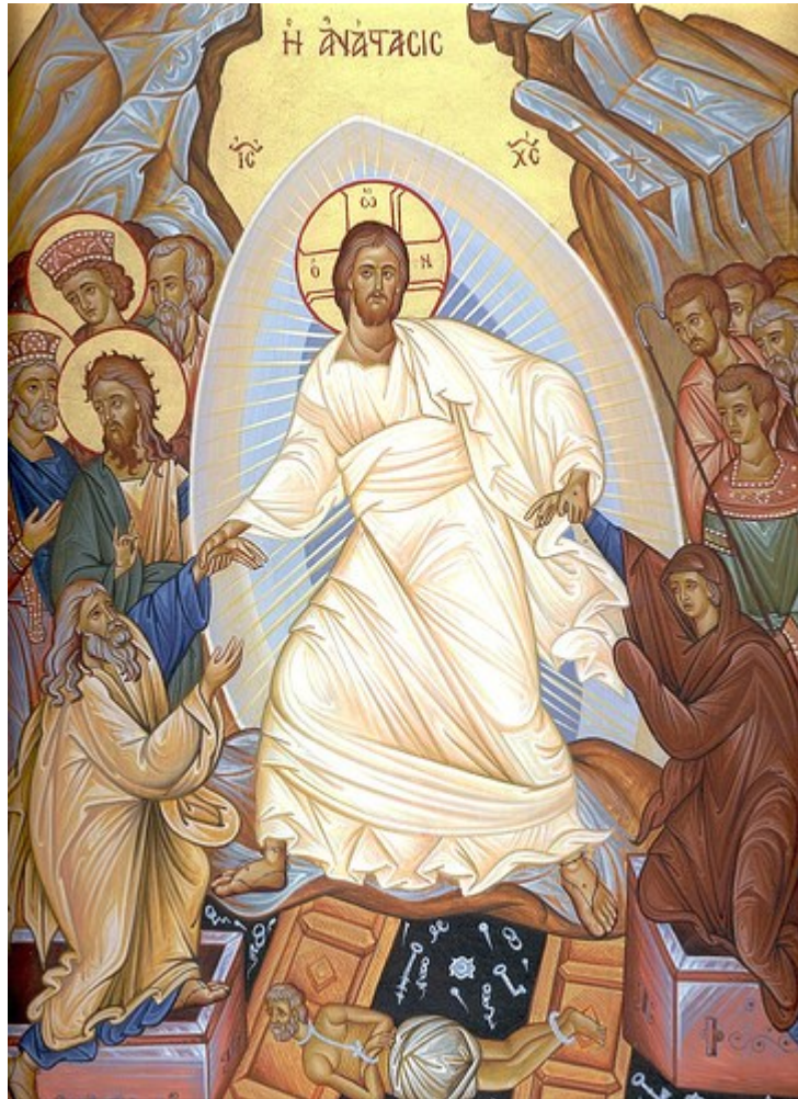
This file is made available under the Creative Commons CCo 1.0 Universal Public Domain Dedication.

Saturday | 5:00 PM Sunday | 8:30 AM (español) Sunday | 11:00 AM