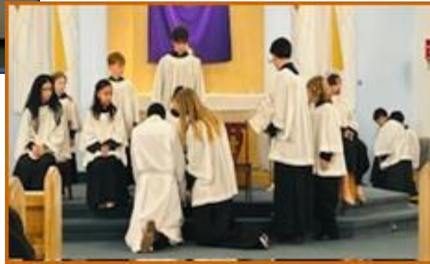
Below: Holy Thursday Service

Does your organization need a newsletter? We'll cover the printing costs!