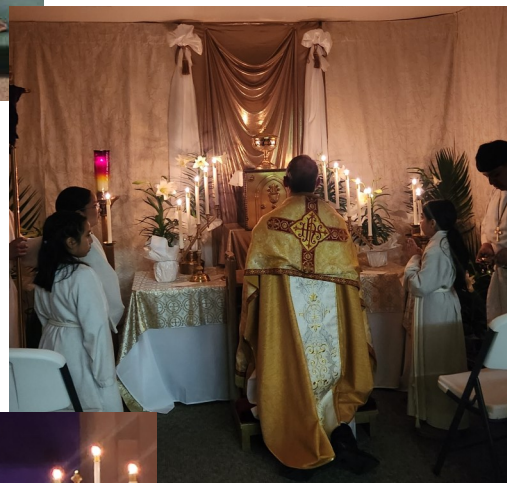
Clockwise from top: Easter Sunday Sanctuary, Altar of Repose, Holy Thursday Mass, Veneration of the Cross