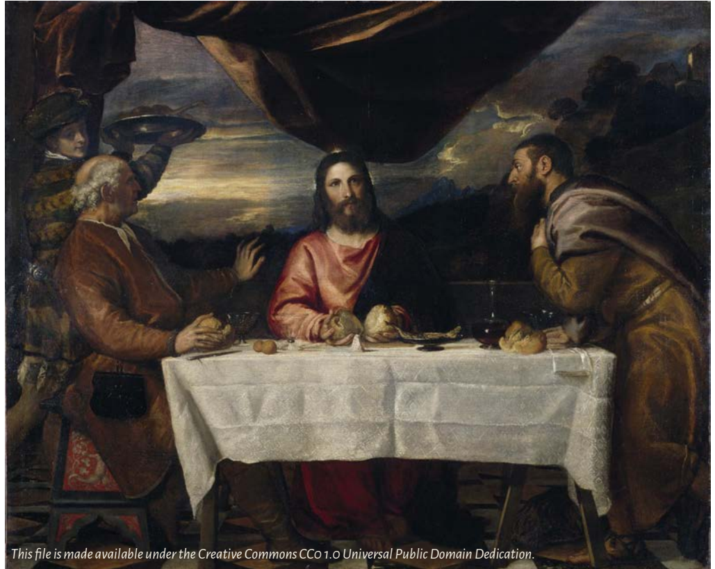
This file is made available under the Creative Commons CCO 1.0 Universal Public Domain Dedication.

Saturday | 5:00 PM Sunday | 8:30 AM (español) Sunday | 11:00 AM