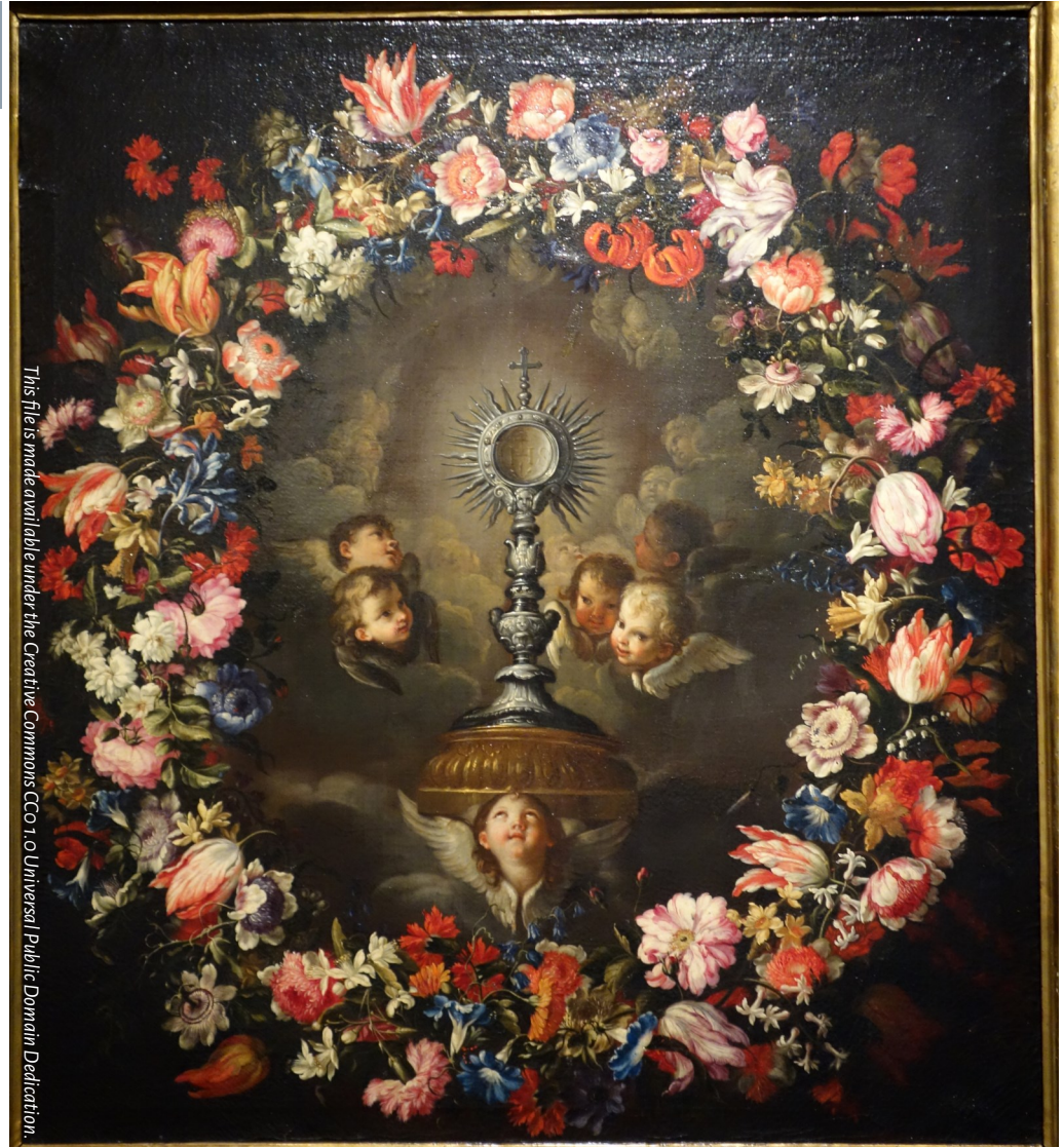
This file is made available under the Creative Commons CC0.0 Universal Public Domain Dedication.

Saturday | 5:00 PM Sunday | 8:30 AM (español) Sunday | 11:00 AM